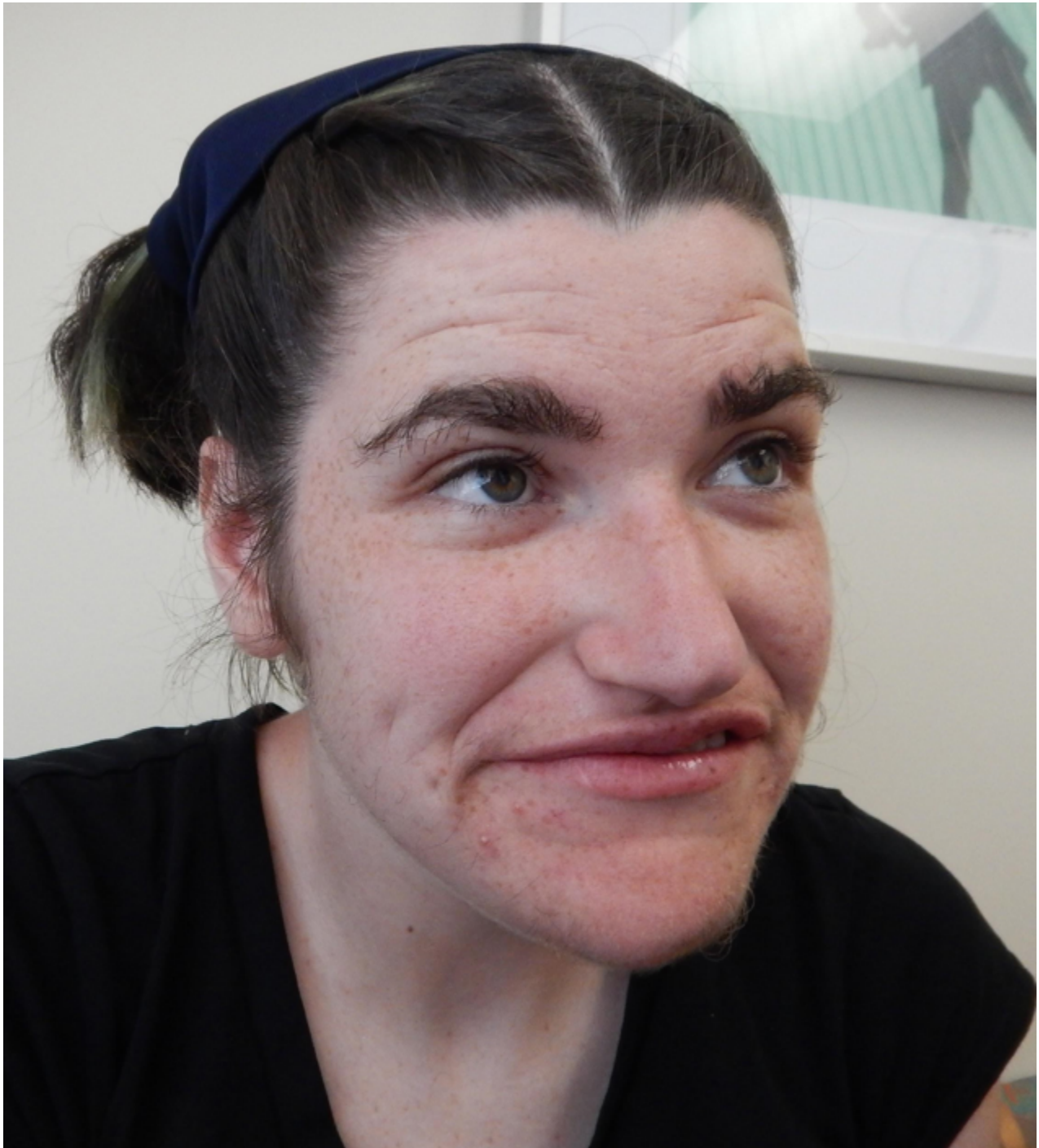
Figure 5. Woman age 24 years with Pitt-Hopkins syndrome (same individual as in Figure 4). Note prominent nose with depressed tip, short philtrum, full lips, wide mouth with downturned corners, and well-developed chin.