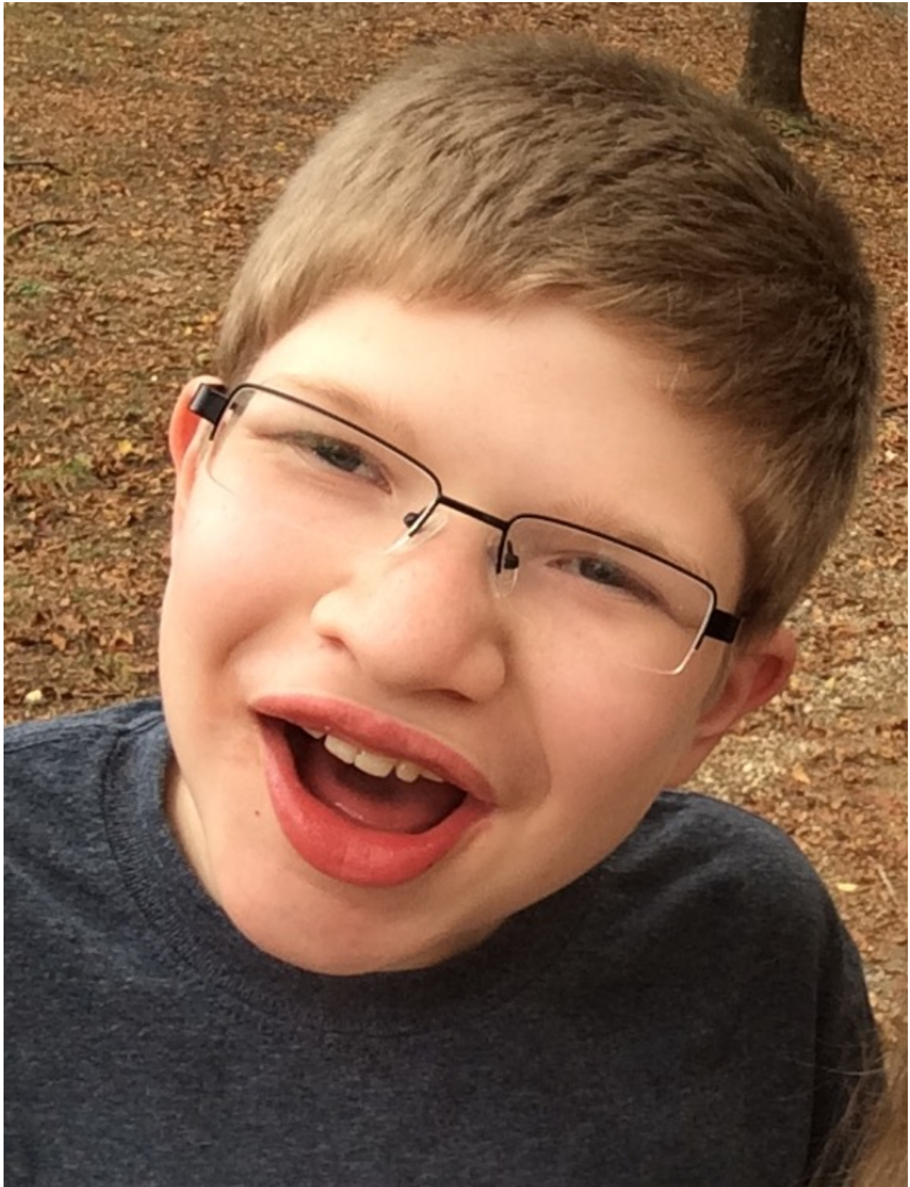
Figure 3. Boy age 13 years with Pitt-Hopkins syndrome (same individual as in Figures 1 and 2). Note wide nasal ridge and alae, short philtrum, and full lips, with everted lower lip.