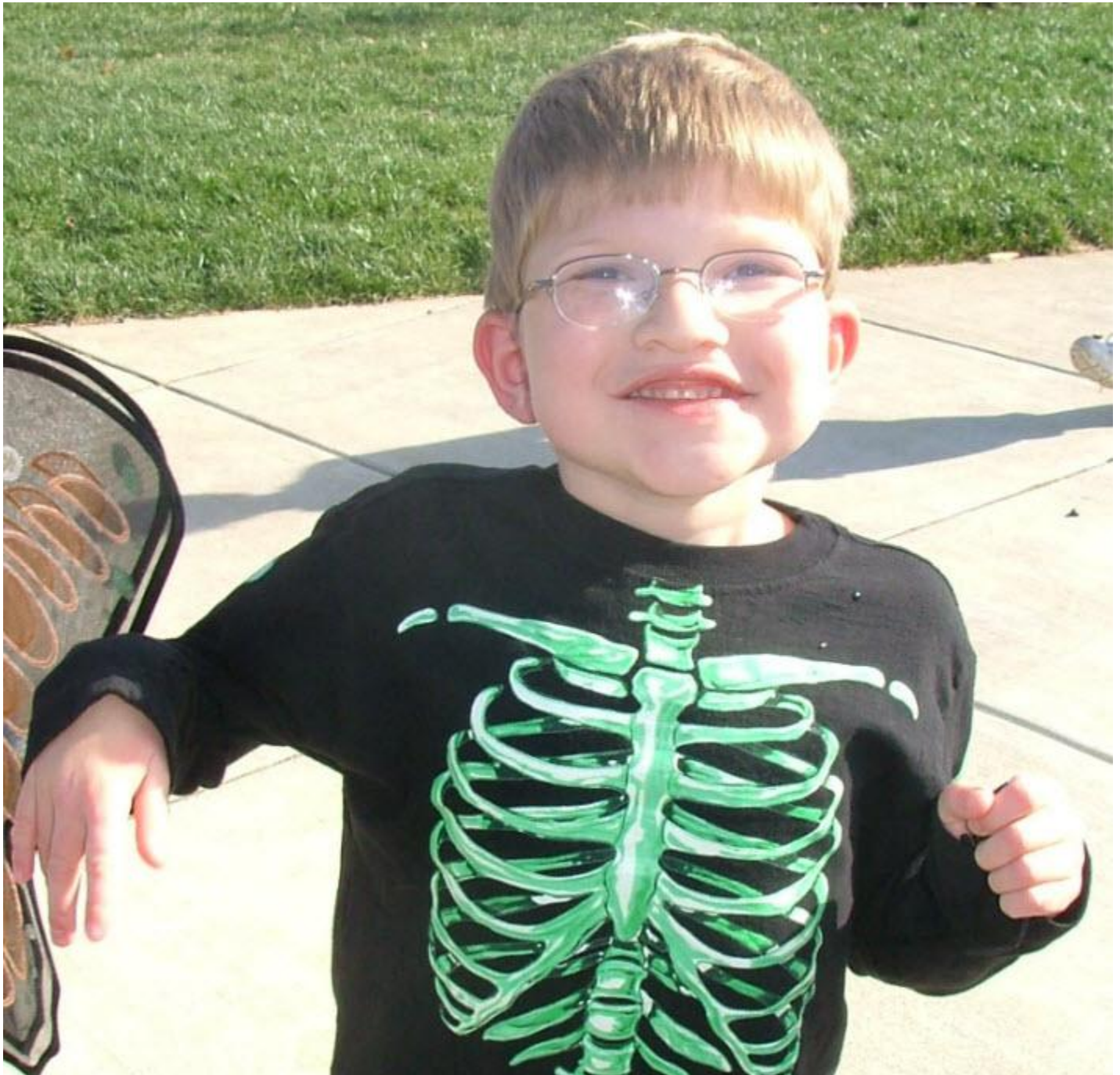
Figure 2. Boy age seven years with Pitt-Hopkins syndrome (same individual as in Figure 1). Note prominence of the lower face with a well-developed chin. He has a cheerful disposition, deeply set eyes, prominent nasal bridge with depressed nasal tip, and wide mouth with downturned corners.

For an introduction to comprehensive genomic testing click here . More detailed information for clinicians ordering genomic testing can be found here .