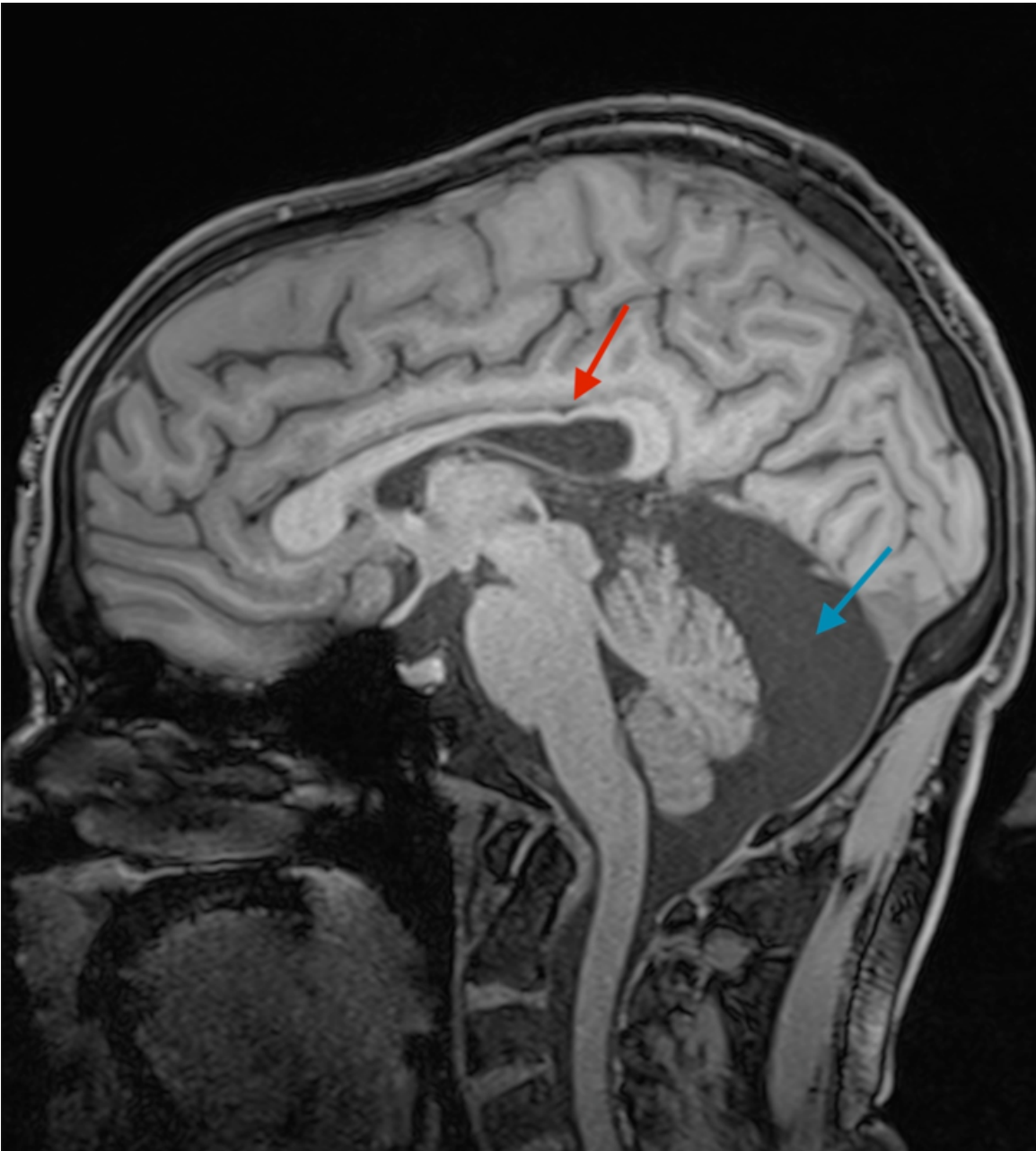
Figure 1. Midsagittal magnetic resonance image of the brain of an adult male with PDE- ALDH7A1 demonstrating thinning of the isthmus of the corpus callosum (red arrow) and mega cisterna magna (blue arrow)

Pathogenic missense variants that result in residual enzyme activity may be associated with a more favorable developmental phenotype [Scharer et al 2010].