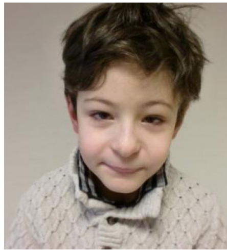
6 years old