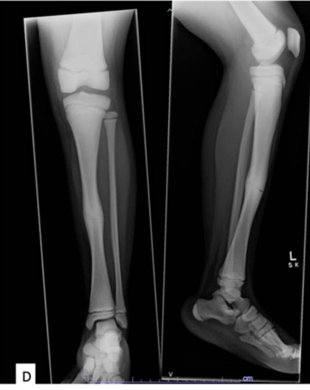
Figure 1. Radiographic features of pycnodysostosis

A. Hand and wrist radiograph in a female age 12 years, showing marked acroosteolysis of the terminal phalanges and generalized increase in bone density.