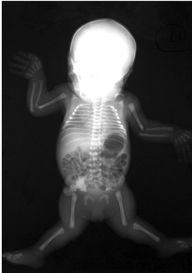
Figure 1. A newborn with molecularly confirmed CHST3 -related skeletal dysplasia. Note the bilateral dislocation of the knees and radial heads.

condition while limiting identification of variants of uncertain significance and pathogenic variants in genes that do not explain the underlying phenotype. (3) Methods used in a panel may include sequence analysis, deletion/duplication analysis, and/or other non-sequencing-based tests.