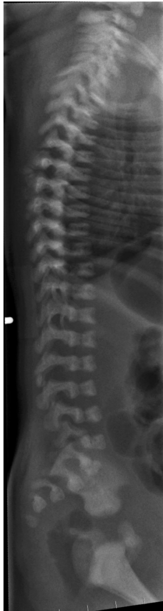
Figure 3. Mild platyspondyly is observed. Note also the coronal clefts throughout the lumbar region.