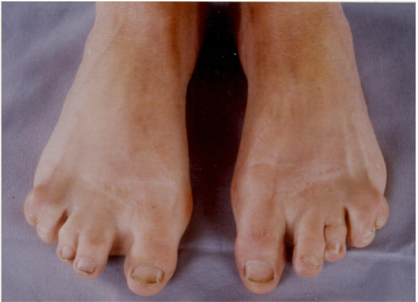
Figure 3. Typical syndactyly of 2nd and 3rd or 4th and 5th toe