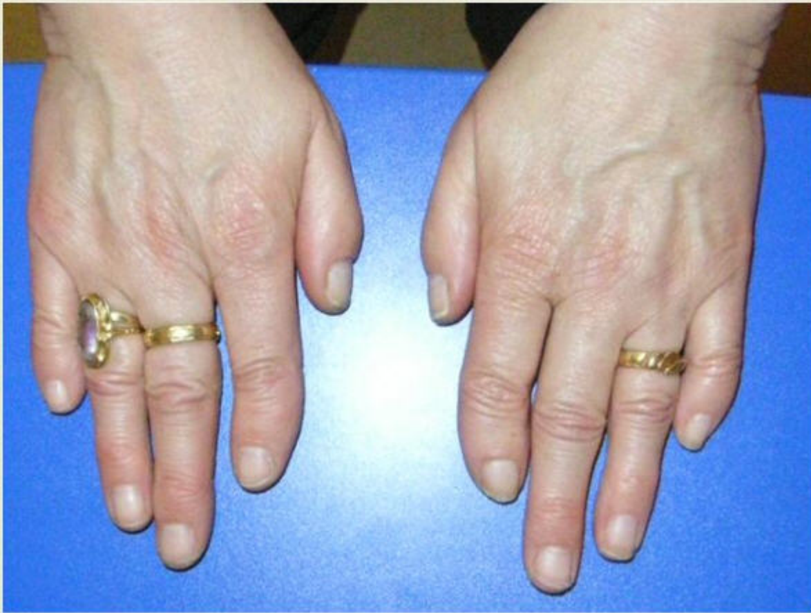
Figure 1. Typical brachymesophalangy in an adult with FS1